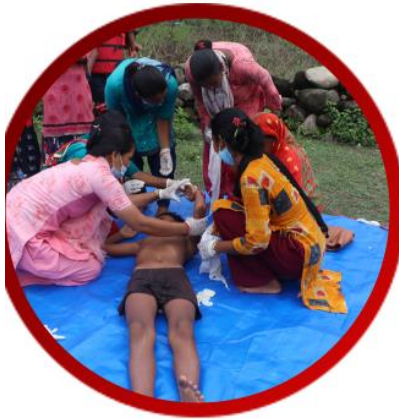
Community Disaster Management Committee (CDMC)