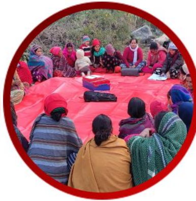
Women Empowerment Center (WECs)