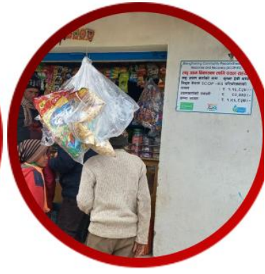
Micro enterprises groups